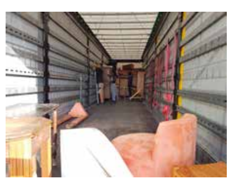
The heaviest items can be placed over the axles (front and rear). If using a curtainsider truck, remember to place rigid items along the sides in order to create a rigid protective envelope, and particularly bed bases, which can be used to hook up straps.

The group also needs to consider how the container will be unloaded when they are loading it. They need to be aware of the sometimes more limited unloading equipment available on arrival. A group of five to 10 people is adequate for loading, but taking it in turns can be worthwhile, as it means that more people will be involved. Ideally, one member notes down in real time what has been loaded in the container, so that the packing list can be drawn up.