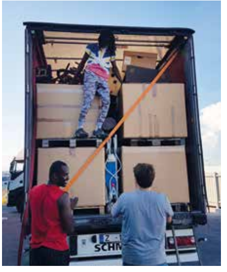
Remember to fill the container little by little up to the roof, so that no room at the top is wasted.

It is absolutely vital that you carefully protect the goods, estrapping in the items as much as possible, wrapping them up with blankets and wedging in everything, using bags of clothing if necessary.