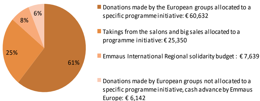
Source of the funding paid out to the groups under the 2015 European Solidarity Programme. Total € 99,763

2 actions, which are part of the 2014 solidarity programme, received the second round of fund allocation early 2015 and were therefore able to finalise the implementation phase in 2015.