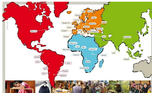
Today, 350 groups in 37 countries

Our goal is to fight the causes of extreme poverty and drive social change by enabling the poorest to take charge of their own lives.