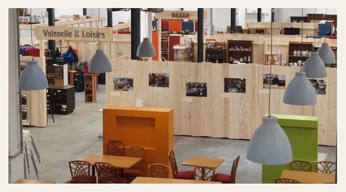
Emmaus Mundo (France).