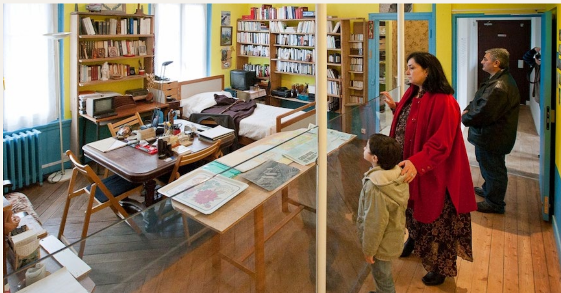
Abbé Pierre's room.