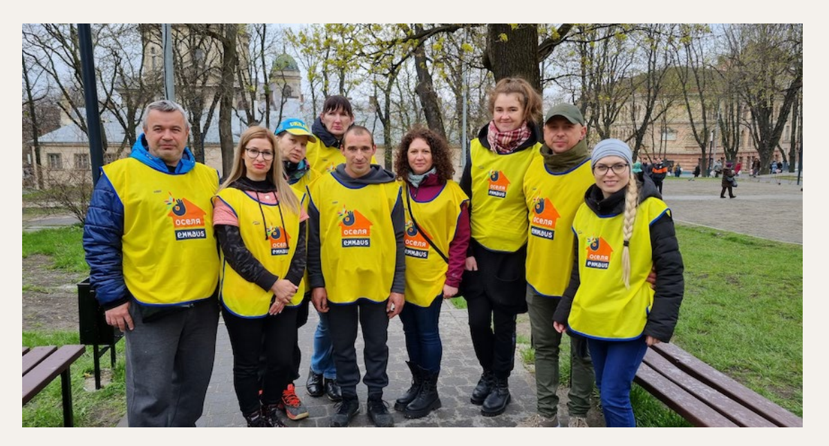
The Emmaus Oselya team handing out food on the streets of Lviv, April 2022, © Emmaus Oselya.

We are already in September, and the war has been going on for over six months. But we have not forgotten that it is happening at the gates of Europe. Our Emmaus groups in Ukraine, Poland and Romania, in Europe, are helping refugees on the ground on a daily basis.