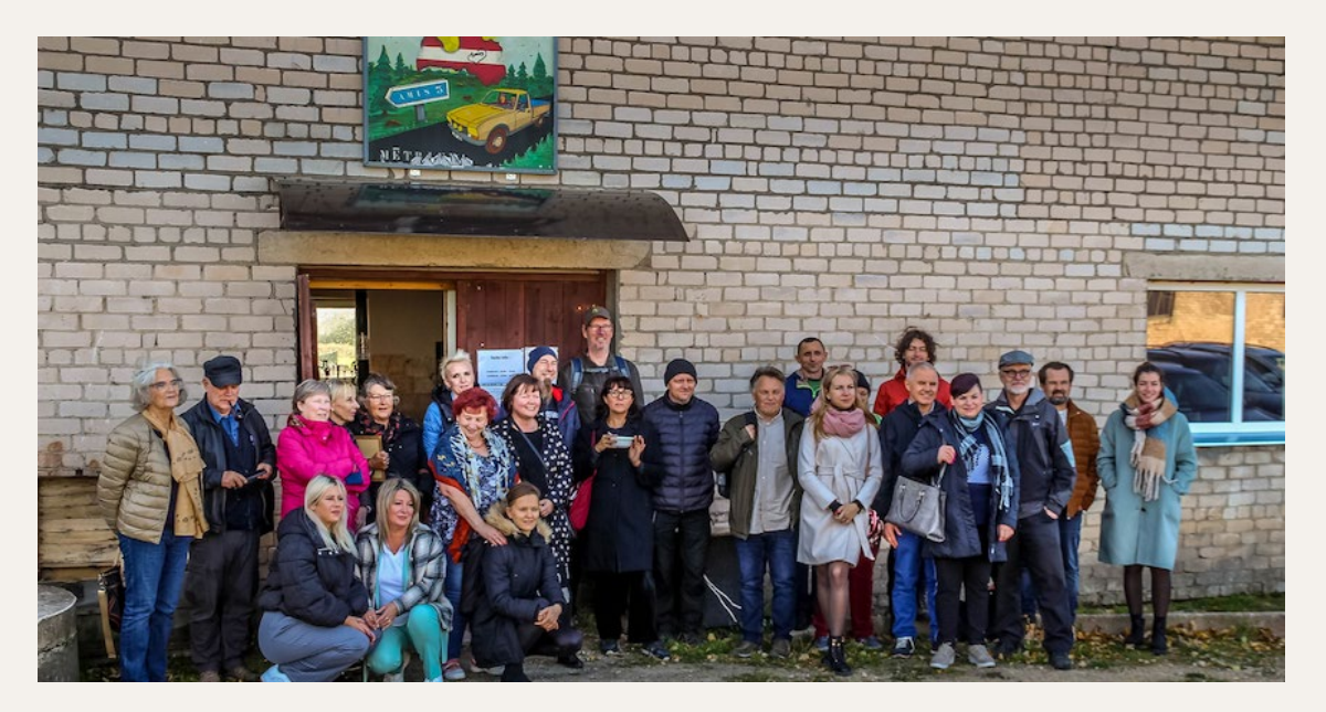
Last meeting of the Poland-Ukraine Collective in Latvia

We are finally there! The three EE collectives (South-East Europe, Poland-Ukraine, and Romania) are back on track! So, don't hesitate, come and chat to colleagues from Romania, Poland, the Baltic countries, Ukraine and South-East Europe!