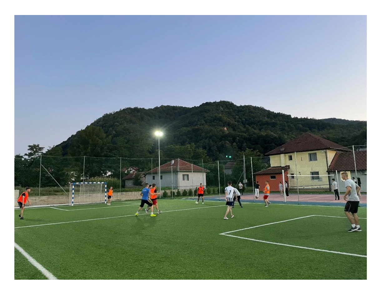
A football match at the 2022 summer camp on the premises of IFS-Emmaus

27-31 July: the first Emmaus Football Cup for Peace and Human Rights, Srebrenica