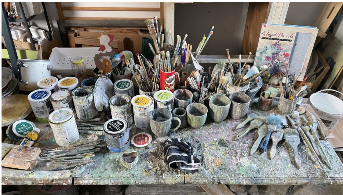
Workshop on painting wood, Emmaus Krakow

ONE LAST CALL to sign up for the next event that is being organised by Emmaus Europe! This exchange will be held in Poland, in the beautiful city of Krakow, and more specifically, in the just-as-beautiful Brat Albert group.