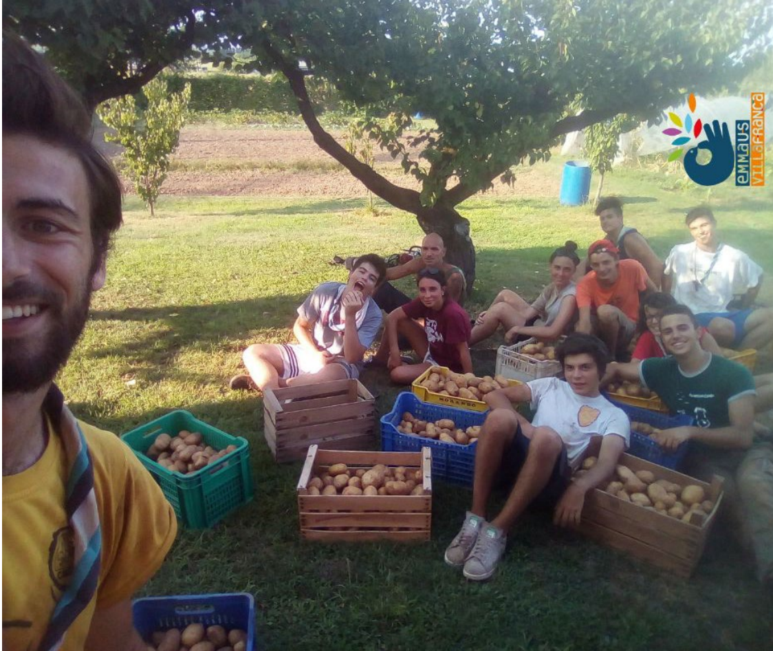
A picture from the summer camp event held by Emmaus Villafranca in 2022!

Like every year, several of the groups in Europe will be organising camp events this summer in order to share Emmaus' values, to allow people to experience life within an Emmaus group and to inspire the next generation to commit to our movement!