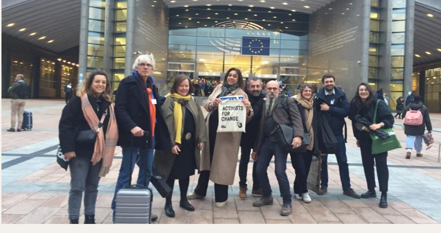
Emmaus representatives at the European Parliament in Brussels.

On 31 st January, Emmaus Europe organised a commemoration of the 70 th anniversary of Abbé Pierre's radio appeal. To mark the occasion, we took a piece of Emmaus straight to the heart of the European Parliament in Brussels, by recreating an Emmaus salon and setting up an exhibition on Abbé Pierre and an IndignAction video recording zone.