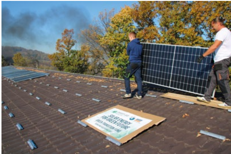
IFS-Emmaus project supported in 2022.

Please contact Emmanuel if you want to invest in a meaningful project.