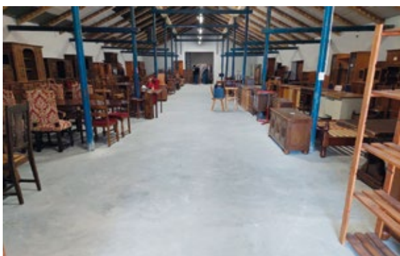
The new concrete floor and attractive pink roof – all the work makes Emmaus Satu Mare's warehouse fire safety compliant (Romania).

A brand-new refrigerated truck and a community kitchen that complies with standards for Emmaus Iași. The improvements enable Iași to continue delivering outreach initiatives in good working conditions.