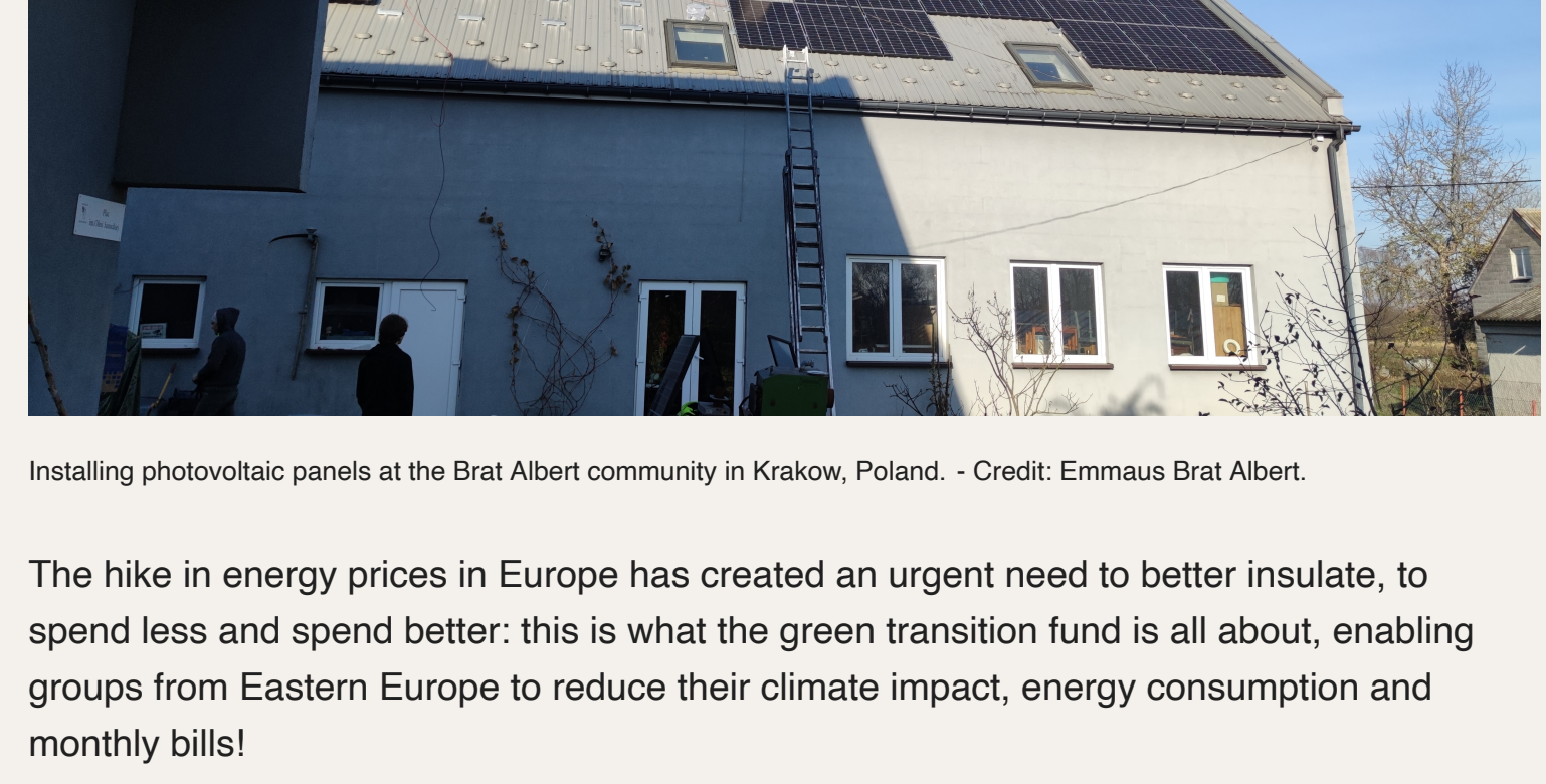
Installing photovoltaic panels at the Brat Albert community in Krakow, Poland.

The hike in energy prices in Europe has created an urgent need to better insulate, to spend less and spend better: this is what the green transition fund is all about, enabling groups from Eastern Europe to reduce their climate impact, energy consumption and monthly bills!