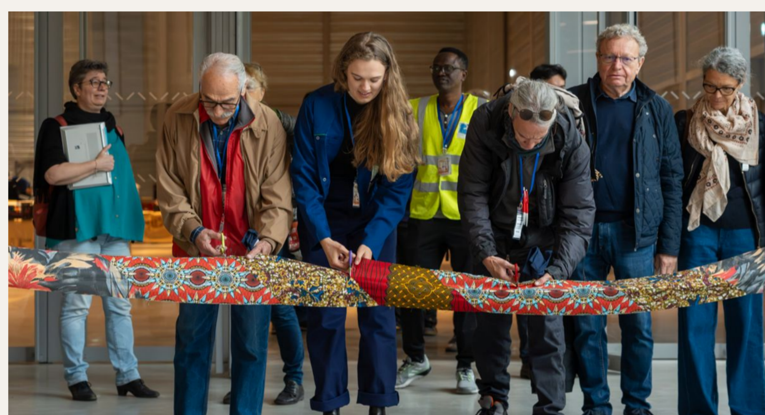
Official opening of the Strasbourg Salon, organised by Emmaus Mundo!

Solidarity also comes to life through the salons organised by the Emmaus groups. The months leading up to it have also been full of festive events, where people have been able to meet each other and finance international solidarity!