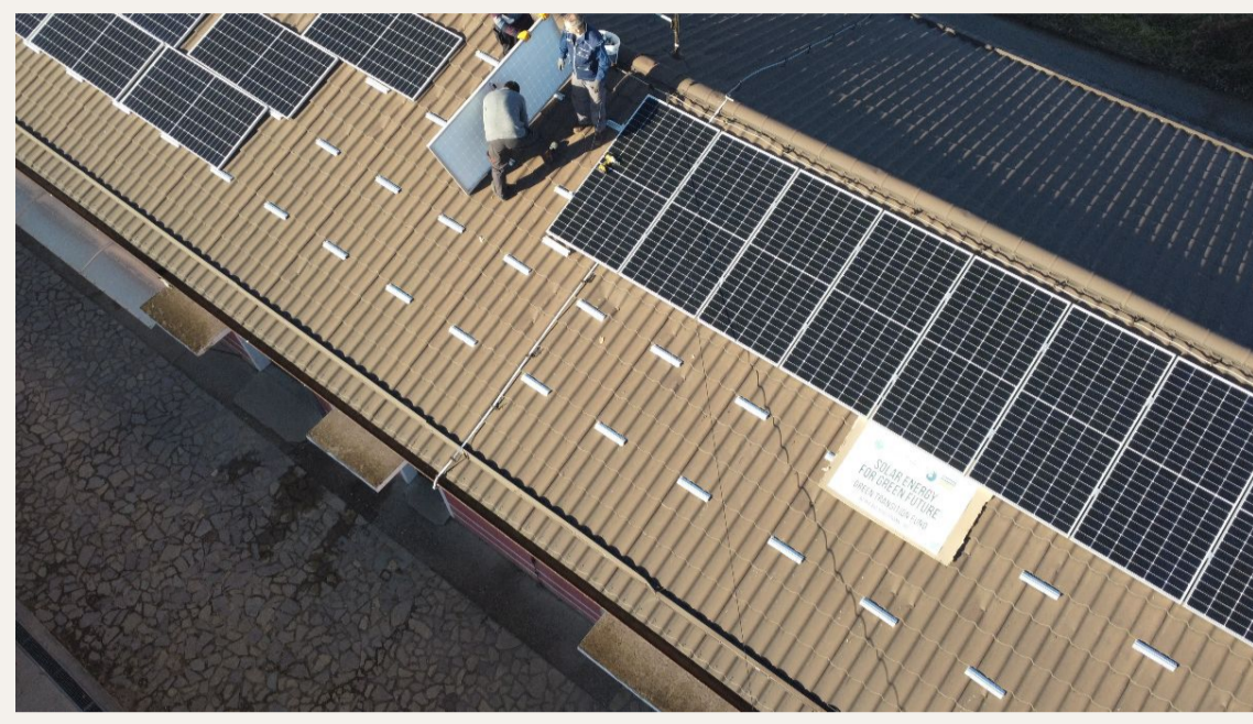
Caption: The IF-S-Emmaus project - Solar Energy for a Green Future - which, in 2022, saw the installation of solar panels generating over 25,000 kWh of electricity per year

There we have it - the Emmaus Europe Green Transition Fund (GTF) celebrated its fourth anniversary in April 2026! Set up in 2022 with an initial budget of €200,000, the GTF has already supported twelve projects submitted by nine Emmaus groups in Eastern Europe. Emmaus groups can contribute to this fund to improve the support provided to companions.